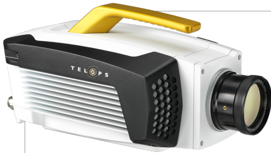
The IP-67 certified enclosure.