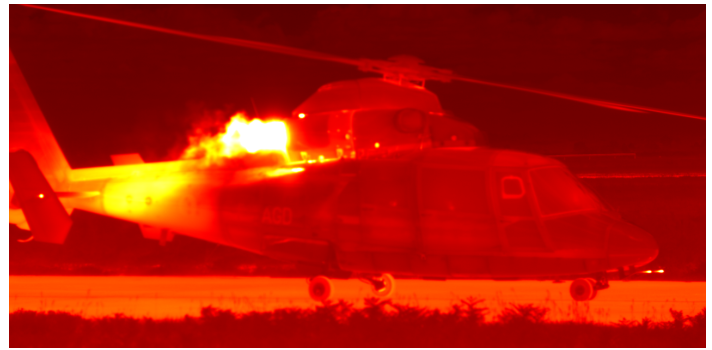
Helicopter IR signature characterization