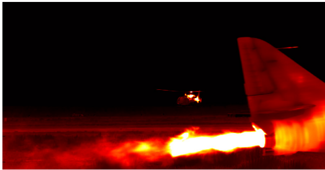
Jet engine IR signature measurement